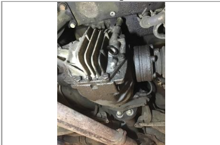
Axles - Image 1 of 1