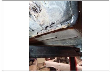
General underbody corrosion / Waxoyl 61000 - Image 2 of 4