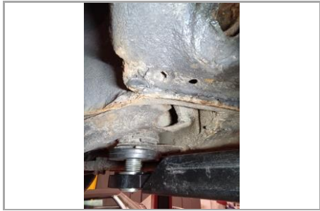
General underbody corrosion / Waxoyl 61000 - Image 3 of 4