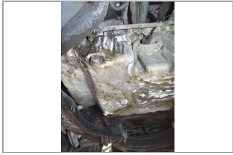
Check for general oil leaks 18000 - Image 2 of 2