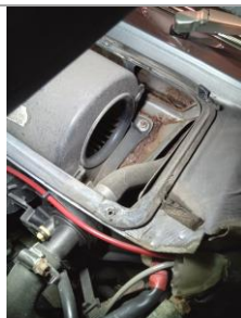
Remove heater box lid-check bulkhead